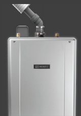
EZTR 2" Flex Vent