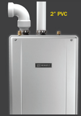
EZ-SV Single Vent