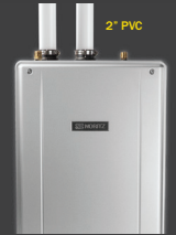
EZ-DV Direct Vent